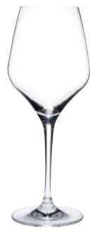
Rotwein Red Wine

233 mm h, ø 91 mm 9,2" h, ø 3,6" 470 ml 16,0 fl. Oz.